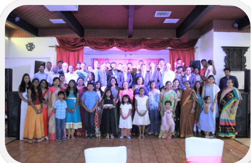
Los Angeles, CA