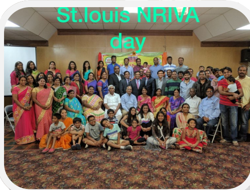
St Louis, MO