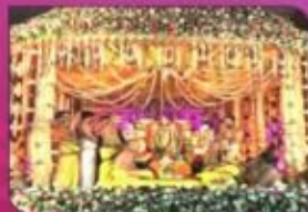
Lakshmi Narasimha Swamy Kalyanam