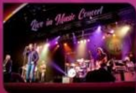
Live in Music Concert